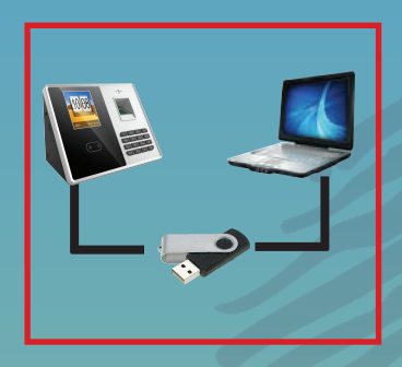
Admin Collect the data from device using USB Disk