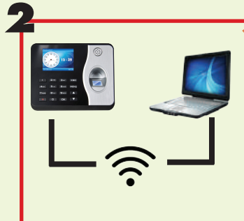
2 Admin Collect the data through WIFI