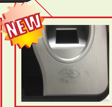
Access Card Friendly